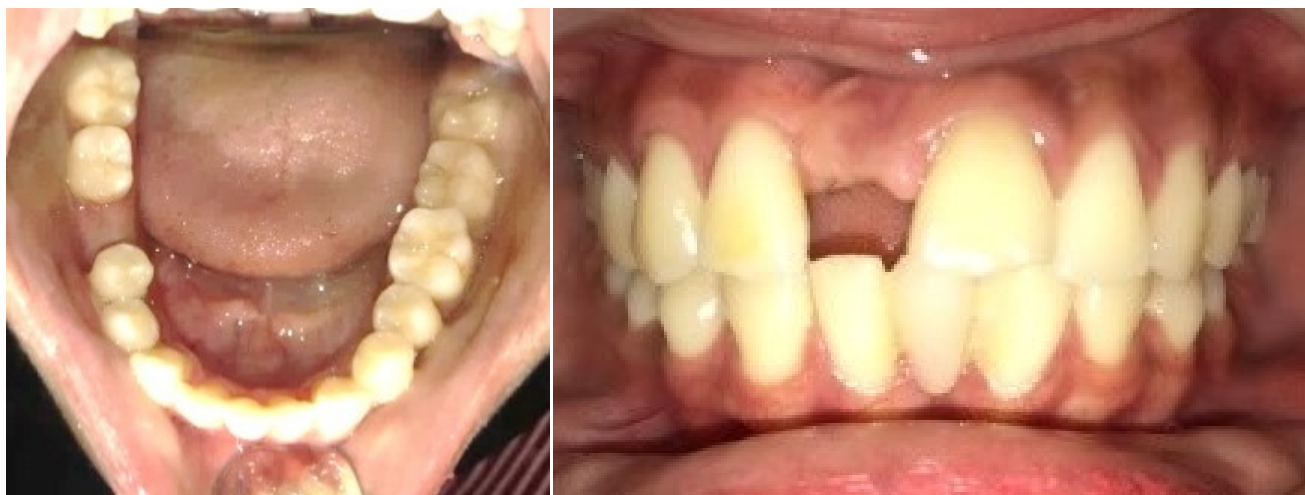
Figure 2 Intra Oral