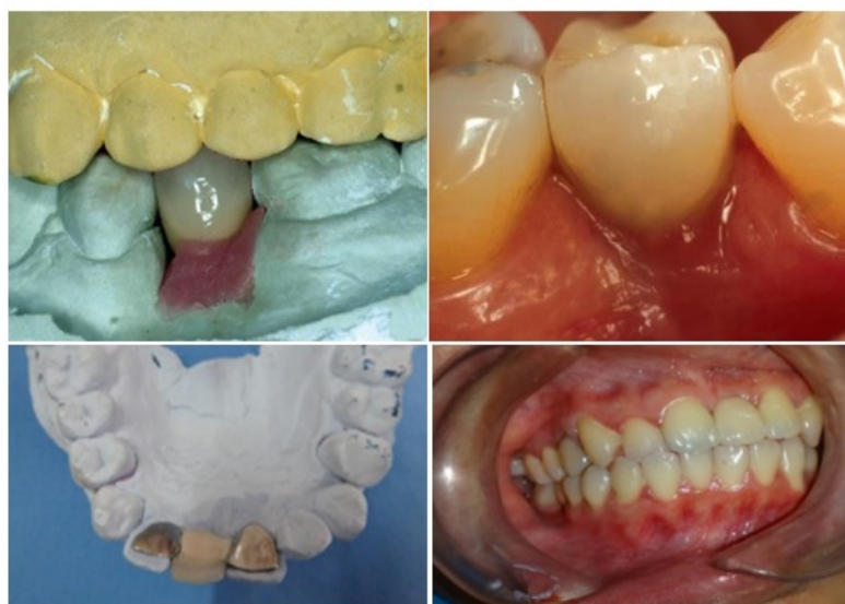
Figure 5 Supra structure 36, adhesive bridge, intra oral after insertion adhesif bridge

casts, then proceed with making a surgical casts, then proceed with making a surgical template. After that, a ct-scan was performed to determine the size of the implant that matches the size of the available bone.