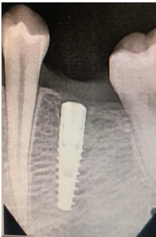
Figure 4 Implantation regio 36